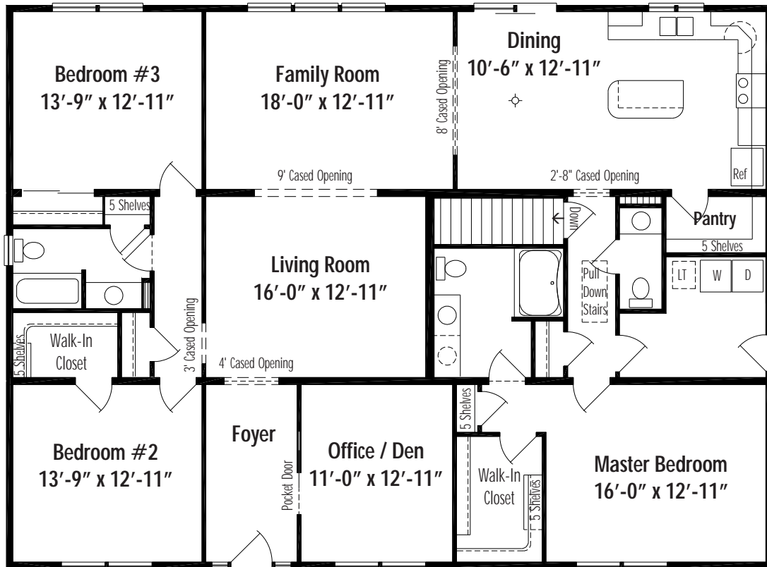
Waverly F Basement 41' x 56', 2296 Sq. Ft. Living Area

Floor plan dimensions are approximate. Artist's floorplans, elevation renderings and photographs are for illustration purposes only and may include optional features. Garages, porches and other attachments are not included unless specified in the written contract. All construction details and specifications must be written in the contract. No oral conditions.