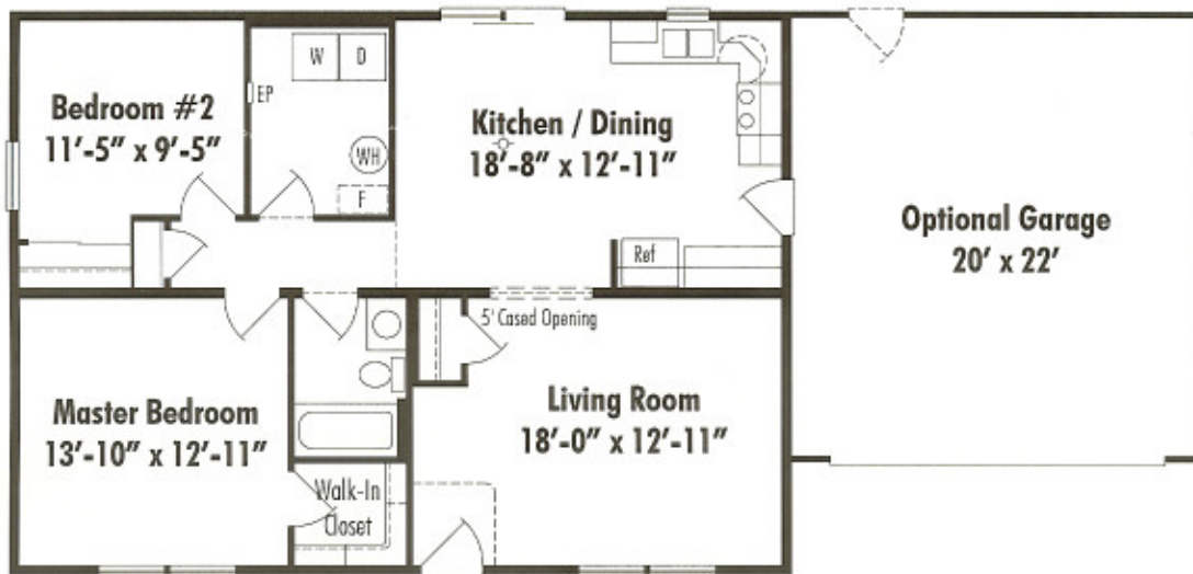
Logan Crawl Space 27'-4" x 38', 1046 Sq. Ft. Living Area